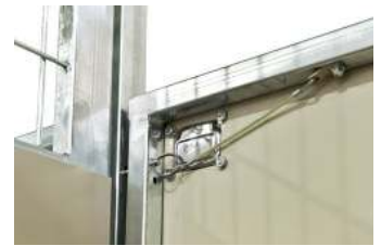
Locking Pin for Floor