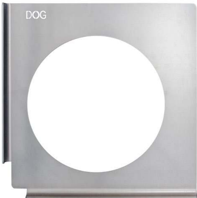
Template to guide cutting for retrofitting the portals.