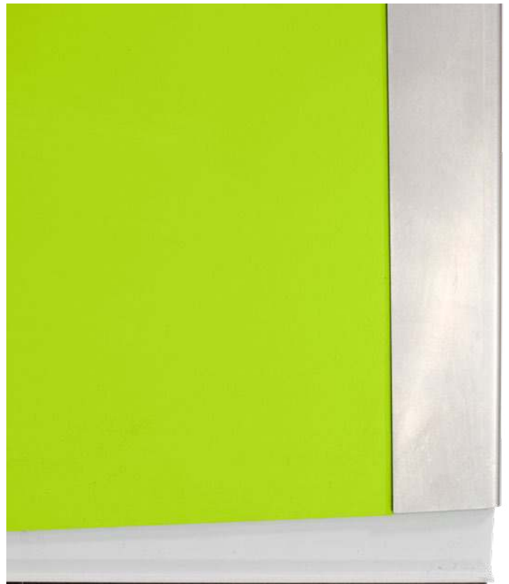
The PVC, adjustable, sealing channel with a neoprene gasket hugs the floor's slope for triple protection from cross contamination.

The Perfect Panel Design™ has an adjustable, sealing channel with a neoprene gasket that hugs the floor's slope. The channel bar uses corrosion-proof, construction-grade PVC that won't be affected by common cleaning chemicals. Aluminum, construction experts warn, is susceptible to pitting corrosion, a common cause of metal failure.