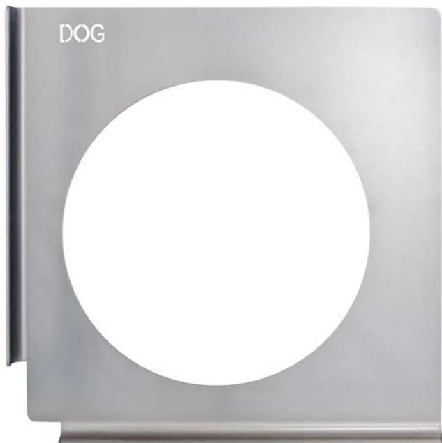
Template to guide cutting for retrofitting the portals.