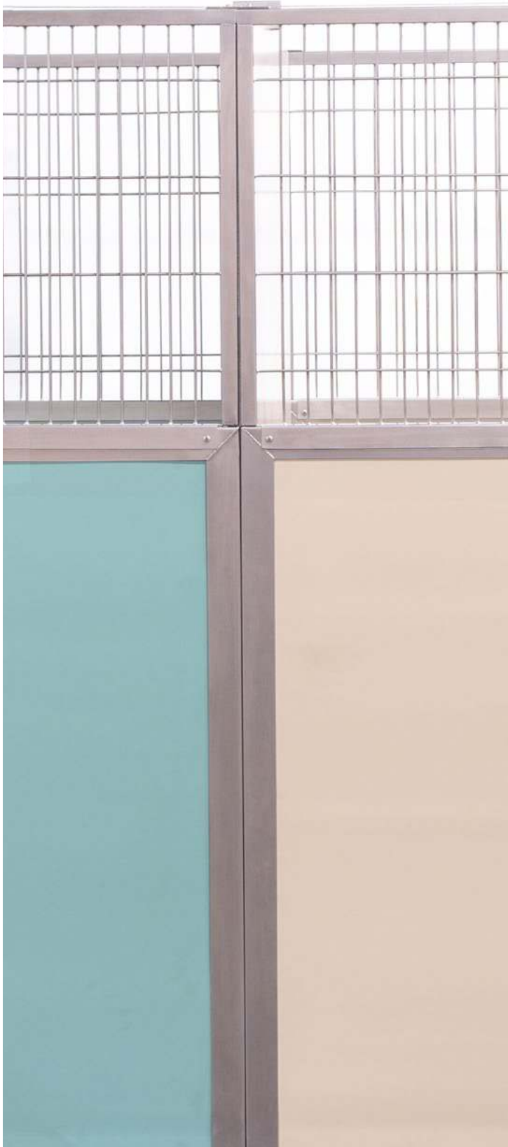
T-Core with Perfect Panel Design™ features a laminated, high-density, closed-cell foam core for insulation and superior durability.

Our durable T-Kennel side and back panels just took a giant step ahead of the field with the strongest core ever put in a pet housing panel: T-Core with Perfect Panel Design™ .