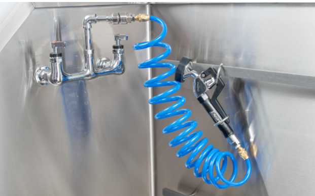
Wall Mount Faucet Coil Hose 804.0139.00 8 lbs. Stainless Steel Hose 804.0006.82 12 lbs.

This hose is 104”L and has a swivel adapter arm that helps easily reach in several directions. The high-flow valve is ideal for washing pets.