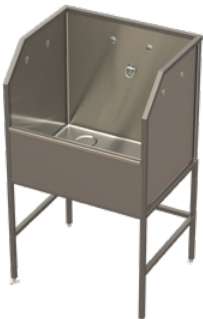
Small Animal Bathing Tub Small Animal Bathing Tub 904.0752.30 367 lbs.