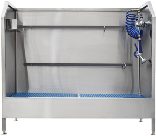
Elite Grooming Shower Right Hand Drain 904.0702.32 367 lbs. Left Hand Drain 904.0702.33 367 lbs.

This spacious shower comes with two PVC coated floor grates and two sliding rings. This accommodates your largest dogs but easily adjusts for smaller dogs.