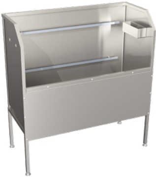
Classic Grooming Tub Right Hand Drain 904.0702.34 367 lbs. Left Hand Drain 904.0702.35 367 lbs.