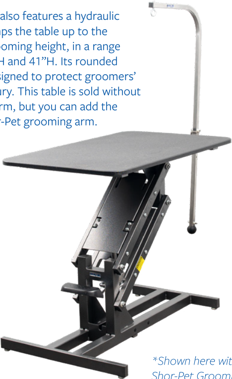
*Shown here with optional Shor-Pet Grooming Arm.

This product also features a hydraulic jack that pumps the table up to the preferred grooming height, in a range between 20”H and 41”H. Its rounded edges are designed to protect groomers’ hips from injury. This table is sold without a grooming arm, but you can add the optional Shor-Pet grooming arm.