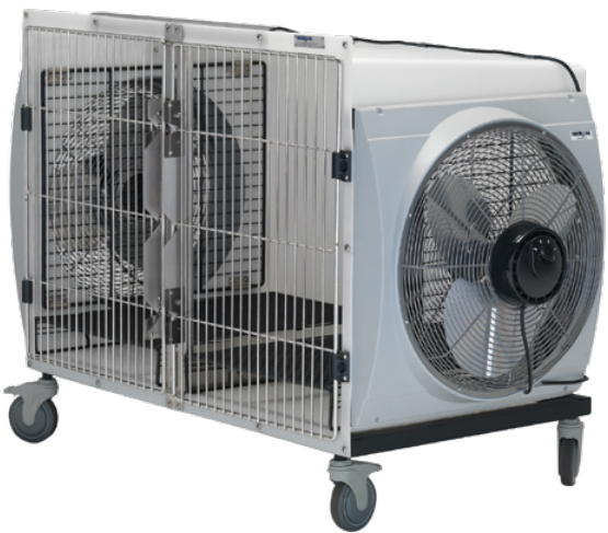
Dryer Cage Single Unit 926.4836.01 129 lbs. Double Unit 926.2000.02 258 lbs. Triple Unit 926.3000.03 205 lbs.

We offer three dryer cage configurations—single, double (two stacked) and triple (a dryer on the bottom with two plastic holding cages above).