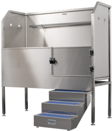
Elite Grooming Tub Left Hand Door, Right Hand Drain 904.0702.40 367 lbs. Right Hand Door, Left Hand Drain 904.0702.41 367 lbs.

These ergonomic design choices save your lower back by allowing you to use your hands and arms, not your lower back when washing the dog.