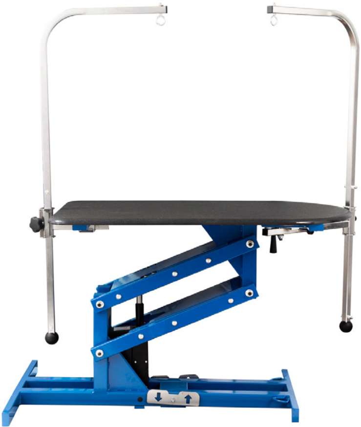
*Elite Grooming Table with Rear Grooming Arm attached